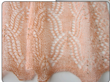
Shown in Red Barn Yarn Lace Glow color Imperial Orange Topaz; Miyuki beads color #234 Metallic Gold-lined Crystal

Skill Level Intermediate or adventurous advanced beginner lace knitter